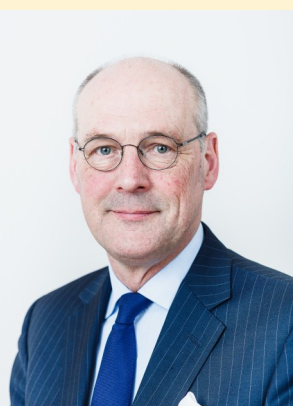
Prof. Dr Rutger Jan van der Gaag CPME Vice-President

For all challenges and health risks caused by greater interactions between humans, animals and the environment, the 'One health' approach is particularly relevant. Examples include zoonoses (diseases that can spread between animals and humans, such as flu and rabies), antimicrobial resistance (when bacteria change after being exposed to antibiotics and become more difficult to treat), as well as modern diseases caused by the current life style. Obesity, cancer, natural or humanmade disasters, food and feed safety crisis are also relevant.